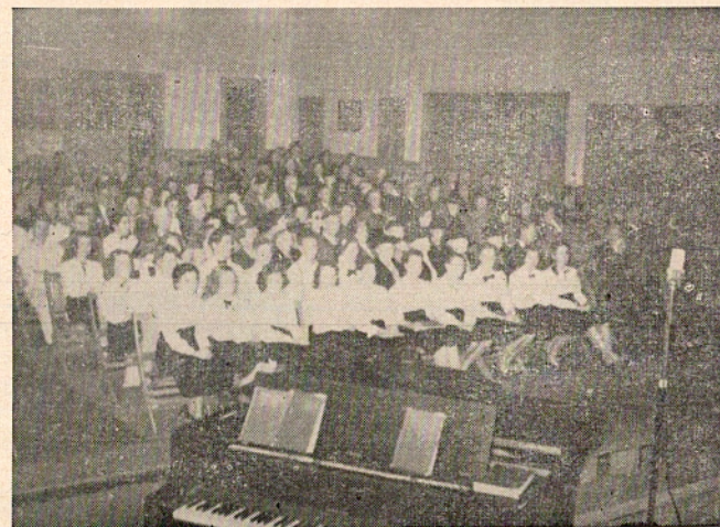
1948 Sunday School Conventon