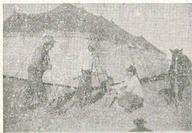
Gospel tent where revival is now in progress.

We ask the "News" readers to join in prayer that God will give an ingathering of souls for the kingdom, and the establishment of a Pilgrim Church in Eloy, that will be a gospel lighthouse to point out the way of Salvation and a place where the saints may be builded up in the Faith.