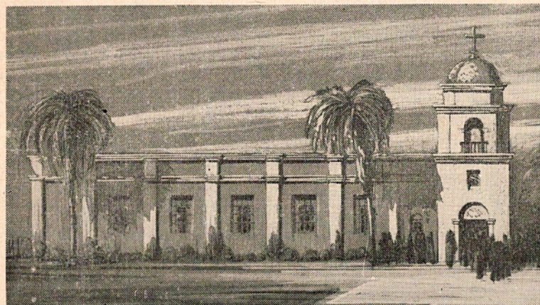
PROPOSED NEW BUILDING The El Monte Pilgrim Holiness Church CORNER HOYT & KLINGERMANN