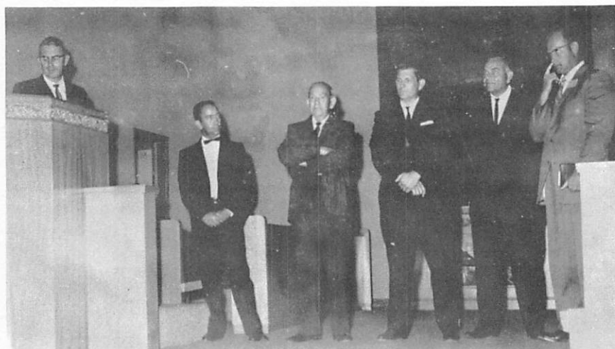
"Transformed Lives - The Fruits of our Ministry" The Laymen's Witness