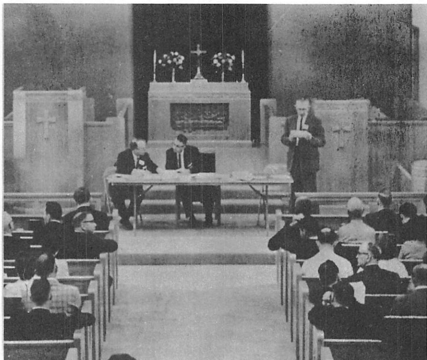
An Annual Conference Session