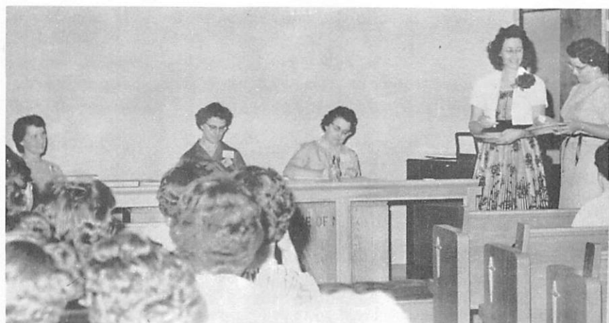
A Woman's Missionary Society Conference Session