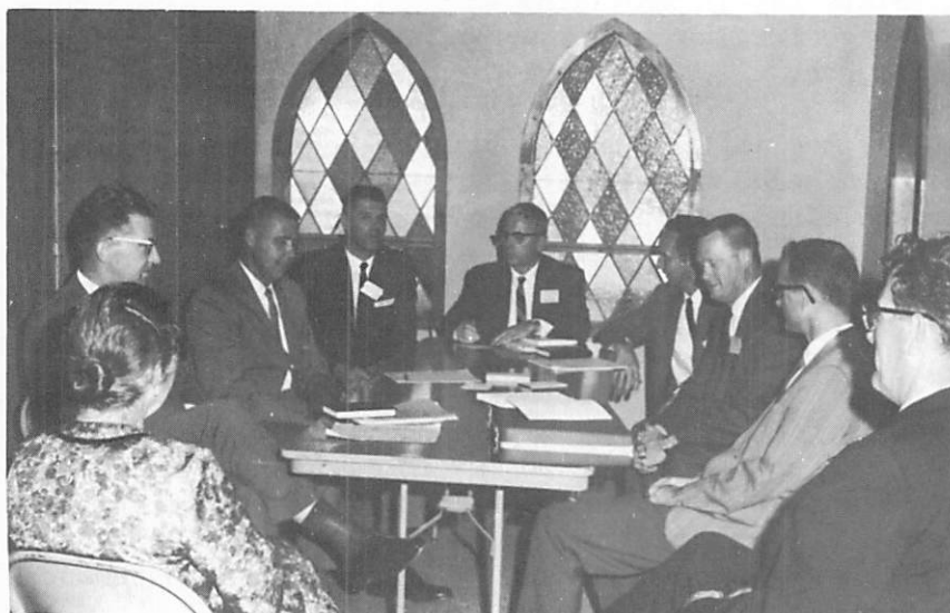
Pastoral Relations Committee at work

2. All people attending the Nursery, Primary or Junior Church activities on the church premises during the regular announced Morning Worship Sessions be counted as attenders of the Worship Service.