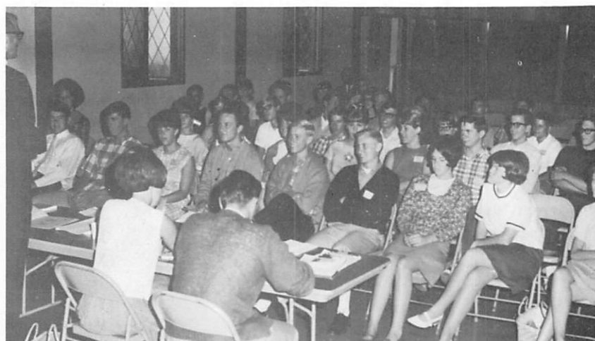
California Conference Wesleyan Youth in session at Whittier, July 1966