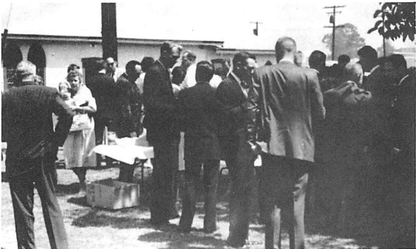
Coffee-break, the daily fellowship time