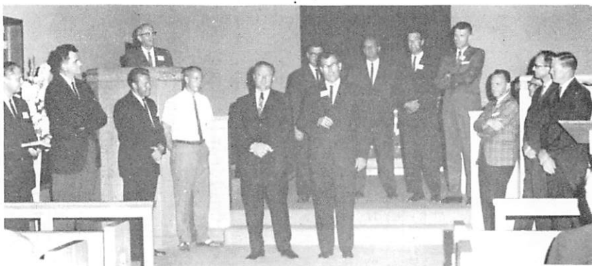
Pastors present Key Laymen