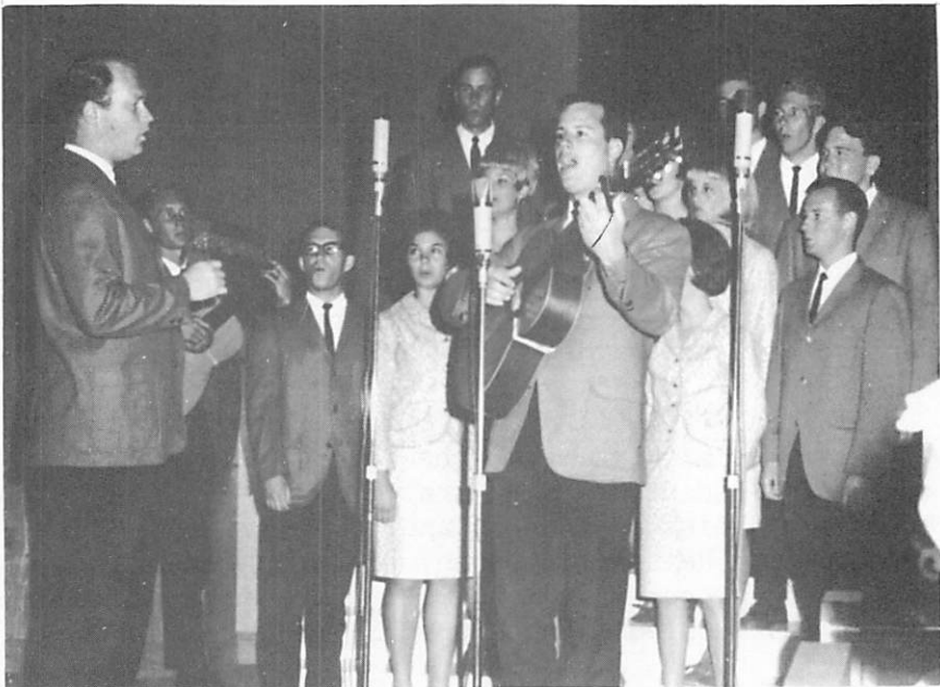
Los Neofones, Skyline Collegian Ensemble _____ _____ challenges the Conference for Missions