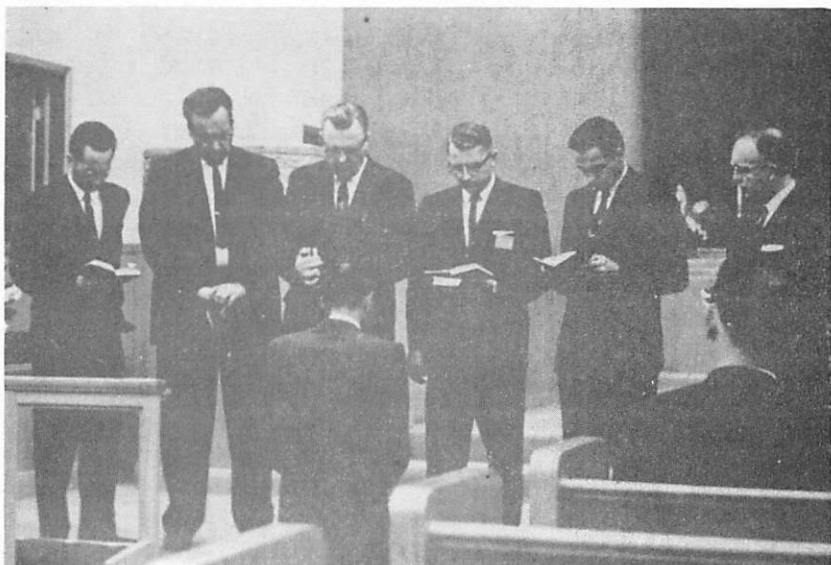
Ordination Ritual - Monday, June 17, 1963