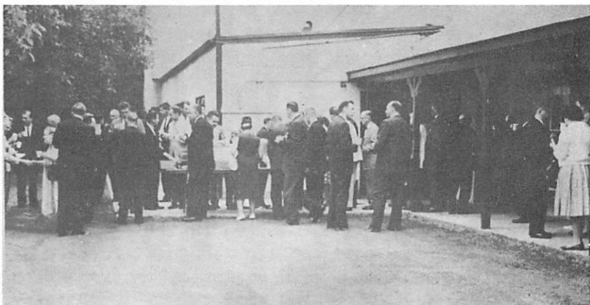
At Coffee Break ---