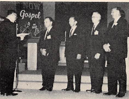
Installation of Conference Officers