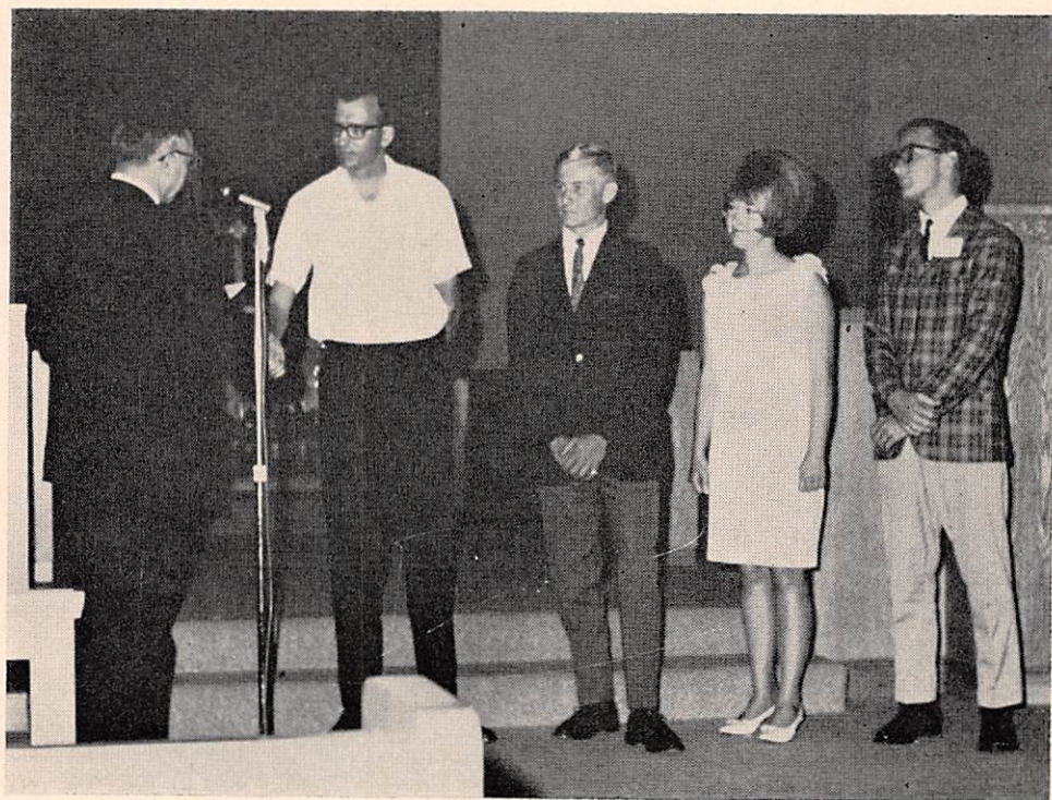
Installation of WY Officers