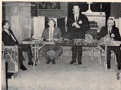
New President in Chair