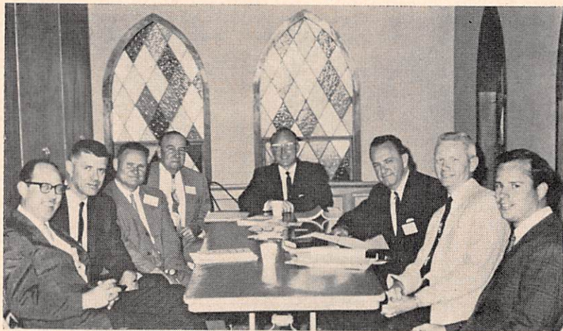
Pastoral Relations Committee

2. All people attending the Nursery, Primary or Junior Church activities on the church premises during the regular announced Morning Worship Sessions be counted as attenders of the Worship Service.