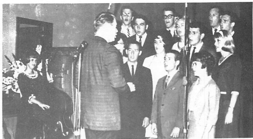
A new Collegian singing group from the Skyline Church.