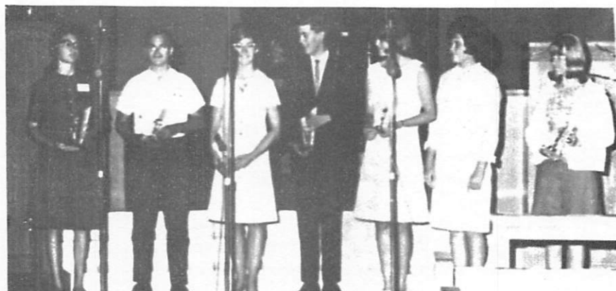
Teen Talent Contest winners of the Central District.