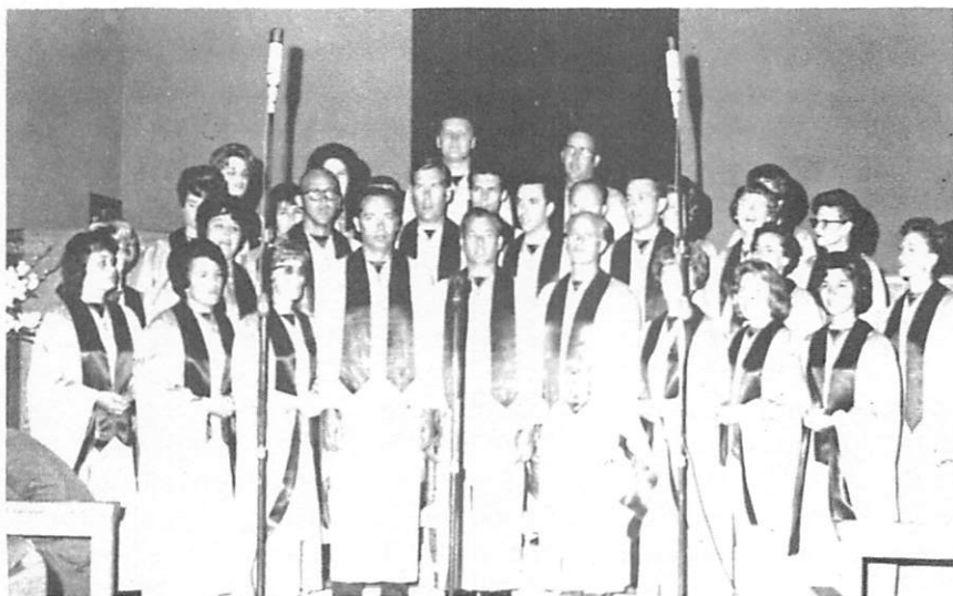
Skyline Chorale presents "Silhouette In Sacred Song"