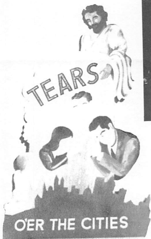
Conference Theme Depicted