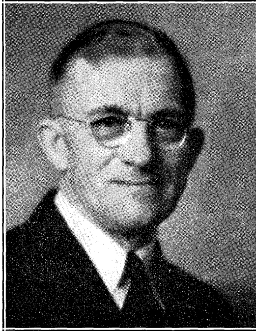
REV. EDWARD LEWIS ELLIOTT

September 28, 1885 - - - January 28, 1940